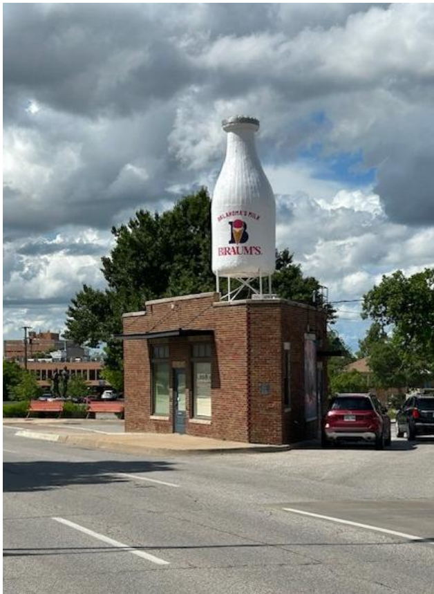
The Milk Bottle at NW 24 th and Classen Boulevard

*All questions about the project must be asked in the Q&A section of the RFQ in Bidnet, with the exception of questions about how to navigate the bidding process itself.